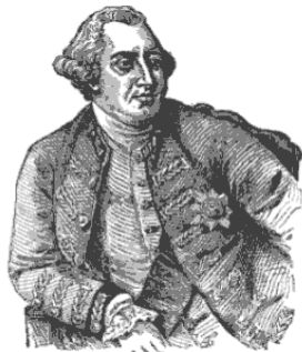
KING GEORGE III.

“It is the French and Indian War that has brought about this rebellion of the American colonists against George the Third,” said the French statesmen when the Revolution began.